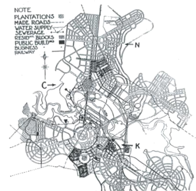
PLAN OF CANBERRA. To illustrate certain references to Canberra we have prepared from official sources a plan indicating the locations of the works carried out up to the past year. It also displays various blanks where the streets and blocks are unplanned, giving a disjointed appearance to the city design. About a dozen settlements are discernible scattered miles apart, the effect of which must be more disconnected possibly than the dismembered planning. The principal shopping centre, referred to in Mr. Griffin's address as "Eastlake," has been renamed Kingston, and is indicated by "K" on the plan. It is about three miles from the Civic Centre (marked C) and six miles from Queenbeyn. The residential subdivisions most recently altered to eliminate the neighbourhood parks, whose function is explained by Mr. Griffin, are shown in alterations to the planning at Northbourne where marked by "W."

Page 266 ADVANCE! AUSTRALIA May 1, 1928.