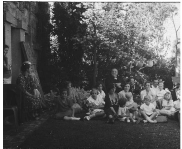
(c1932). Walter Burley Griffin and Marion Mahony Griffin, with a group of people in backyard, Castlecrag, Sydney,

For both Marion and Walter membership of the Anthroposophical Society would become a major part of their reading and community life. The international Anthroposophic News Sheet of 1936 reports that Marion spoke on The four ethers in the races and civilisations and The formative forces and Walter gave a talk on The Trichotomy in land planning . 74 Trichotomy is a central Anthroposophical platform where humanity is understood as essentially threefold; body, soul and spirit. This is clearly a reprise of Walter's 1915 statement of architecture as a spiritual project. The title is a tantalising glimpse into the substance of Walter's paper which may perhaps have explored how land planning could be made to service the needs of these three aspects of the individual in their community and built environment.